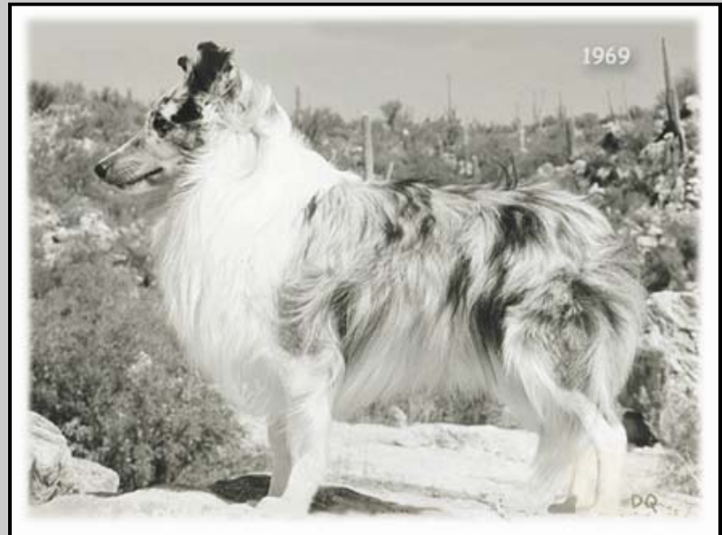
Banchory Duncan Macduff, CDX, HIT

9) Who is your favorite dog not owned by you (living or passed)? Ch. Banchory Thunder Blue, ROM. I loved George from the moment he was born until the day he died.