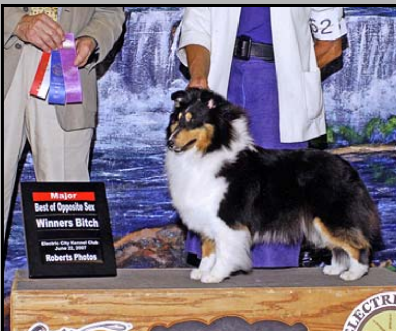
Ch. Clan Duncan Cherden Gossamer. Grace finished last year in 11 shows with a 4-pt and a 5-pt major.

14) What goals have you set for yourself in purebred dogs? I would ascend straight to Heaven if I won Best in Show and High in Trial on the same day. That's a dream! Another is to finish some of my Sheltie genetics work and publish it. My most pressing goal is to re-create the level of intelligence that the best of my old dogs had.