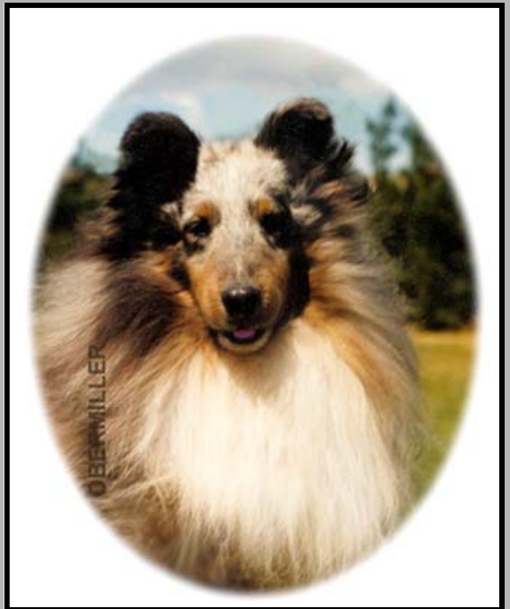
Ch. Banchory Thunder Blue, ROM

13) Is there a dog that you own now that you are particularly excited about? Coming up is a young tri male (7 months), little Clan Duncan River Styx. Styx is something else.