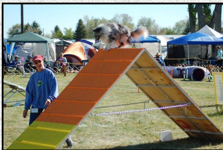
Himark Blue Diamond of Redcoat "Captain" flying over the A-frame in Blackfoot